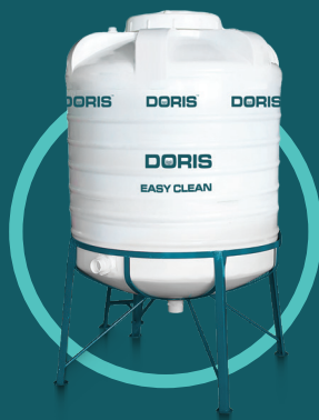
EASY CLEAN TANK