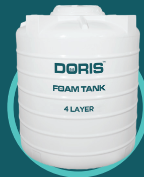
4 LAYER FOAM TANK